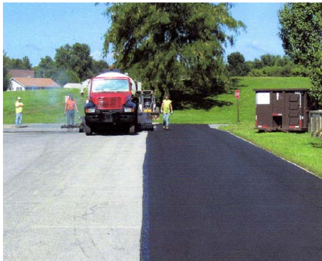
Reduction In Overlay Reflective Cracking With The Petromat System Compared To Control Sections With No Fabric

The Petromat ® System extends the life of new asphalt concrete (AC) pavements and AC overlays. The Petromat System consists of Amoco's Petromat non-woven polypropylene fabric which is field saturated with an asphalt cement tack coat. When placed between pavement layers, the Petromat system becomes an integral part of the roadway section, forming a barrier to water infiltration and absorbing stresses to reduce reflective and fatigue cracking of the new AC surface layer. Since 1965, the economical Petromat System has had an outstanding record of improving pavement performance while reducing maintenance and roadway life-cycle costs. Paving fabric systems are currently being used at a rate of over 15,000 equivalent lane miles per year in North America alone.